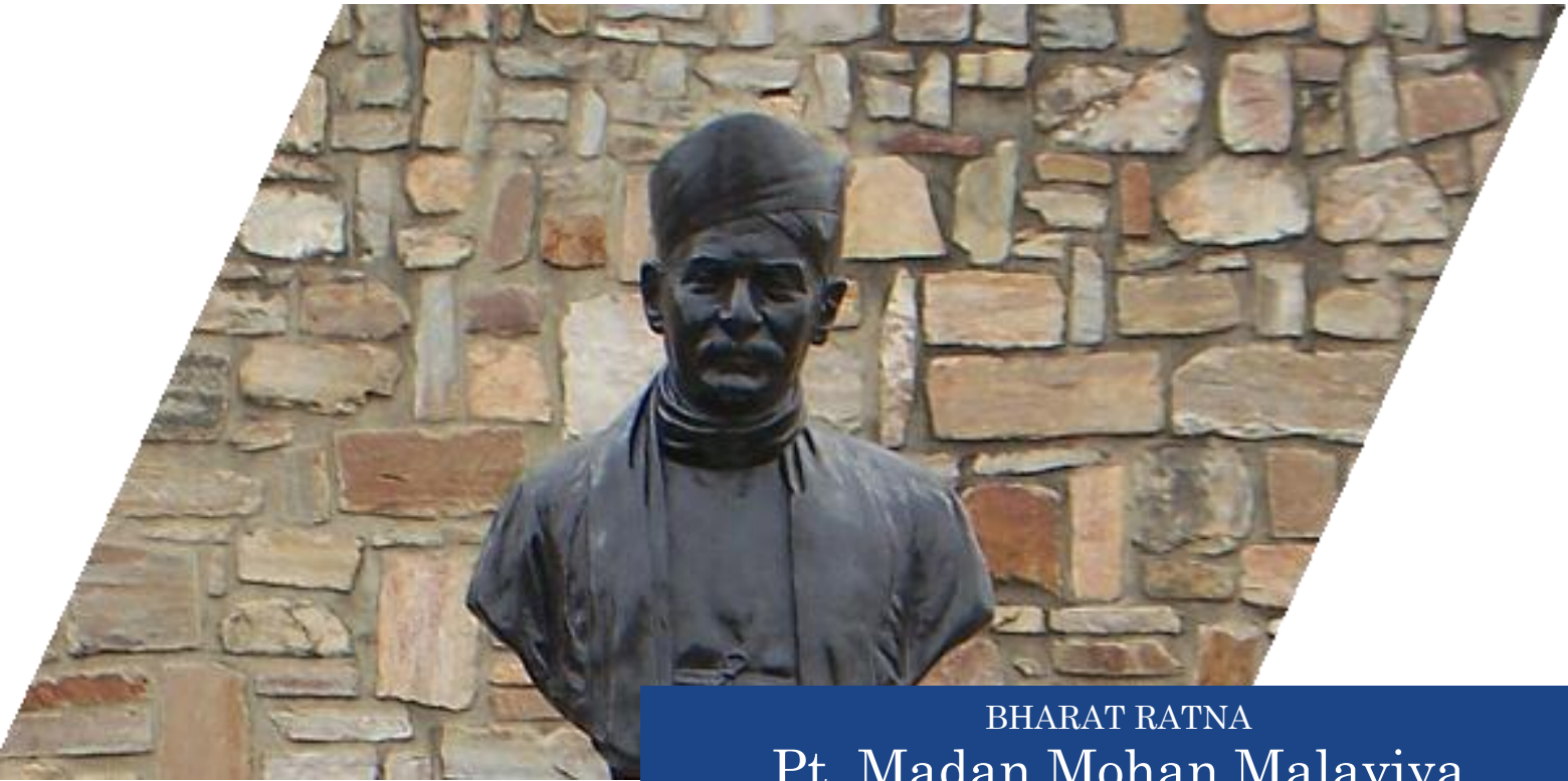
BHARAT RATNA Pt. Madan Mohan Malaviya [1861 - 1946]

Bharat Ratna Pandit Madan Mohan Malaviya, or Mahamana Malaviya, as he was popularly known, was an eminent educationist, social reformer and a distinguished figure of Indian independence movement.